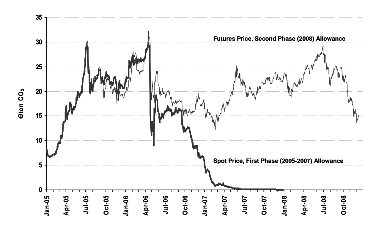
Figure 2 . EU-ETS CO<sub>2</sub> Price History.

Figure 2 shows the evolution of the CO<sub>2</sub> price in the EU-ETS through the first phase and into the first year of the second phase. We show the spot price for a first phase allowance, good for emissions in the years 2005-2007. We also show the futures price for a 2008 allowance, deliverable in December 2008. There are four things to note in the evolution of these prices.